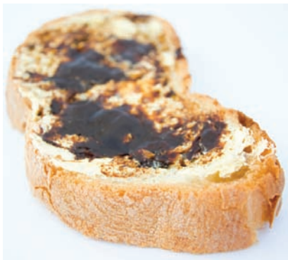
slice of bread