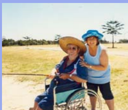
Part of the NSW Health Carers Program in partnership with the Department of Ageing, Disability and Homecare